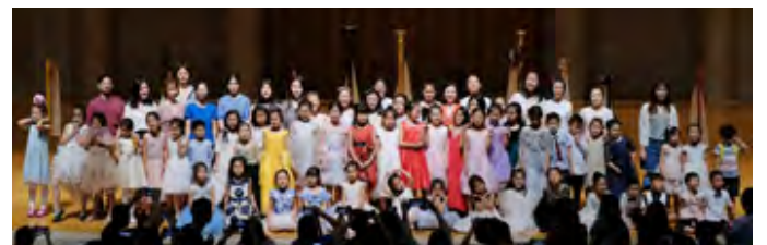
Harp Summer Camp in the Forbidden City, Beijing.

On 8 August 2019 the Closing Concert of the Harp Summer Camp was held at the Forbidden City Concert Hall (FCCH), Beijing. Sixty young musicians aged from 4 to 17, showcased what they had learned for the past four days, performing pieces of harp solos, duos, harp with voices and with other instruments. There were, among them, beginners of the harp, as well as ones who have learned harp for years. They made considerable progress during the four days and enjoyed themselves, sharing music and experience on the FCCH stage.