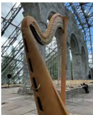
Ruins of Hamar Cathedral.