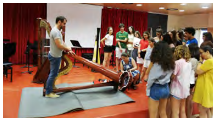
Summer course in Barcelona.

"27th Curs d'estiu d'arpa: West Harp Story " at the Escola Municipal de Música de l'Eixample, in Barcelona, 25 to 29 June 2019. This summer course focused on the music of West Side Story by L. Bernstein. The Cor Jove de l'Orfeó Atlàntida (youth choir) collaborated with harpists from all over Catalonia and also from Valencia and was organized by the Catalan Harp association. Salvi Harps and Euromusica displayed a harp and accessories stand.