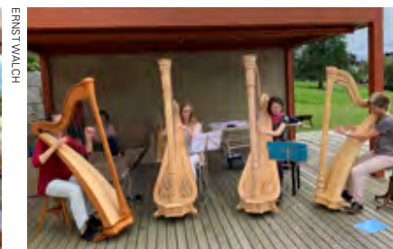
WalHaTa in Liechtenstein.