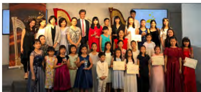
Participants and winners of the second Camac Prize Taiwan.