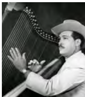
Juan Vicente Torrealba (1917-2019)

“On behalf of the Torrealba family, we fulfill the painful duty of informing you of the death of Maestro Don Juan Vicente Torrealba, surrounded by his children and grandchildren in the peace of his beautiful home,” said his family members through the musician’s Twitter account, without giving other details.