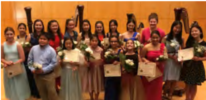
Emerging Artist Division