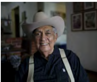
Juan Vicente Torrealba (1917-2019)

Juan Vicente Torrealba, harpist and composer whose distinctive sound gave traditional Venezuelan llanera music a stylized symphonic touch that influenced generations of folklorists, died on 2 May 2019, his relatives announced. He was 102 years old.