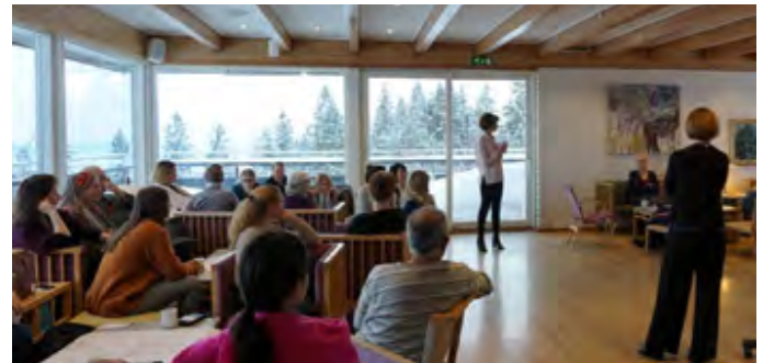
First meeting of the Norwegian Harp Association.

Norway means mountains and fjords to most people, not harps. Here, the harp is listed as an endangered instrument. In 2016, Instruments in Focus was formed, to promote these endangered instruments: harp, oboe, bassoon, church organ and double bass. Their goal is to increase the number to students learning, studying, professionally playing or becoming life-long hobby musicians.